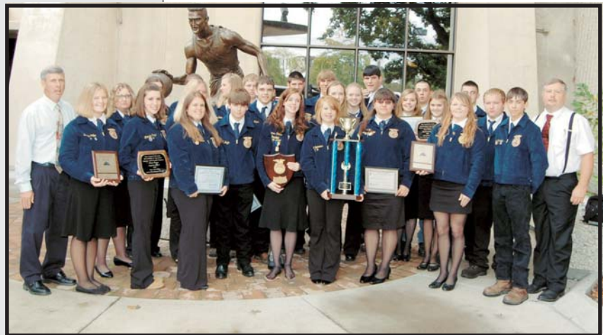
Roane County FFA members and advisors display their winnings after capturing the Sweepstakes Award at the Career Development Events in Morgantown.

Middle school FFA members also had the opportunity to compete in the 7 th and 8 th Grade Agriscience Contest. This event tested students' knowledge in: FFA History; Plant, Seed and Weed Identification; Animal Science; and Agricultural Mechanics.